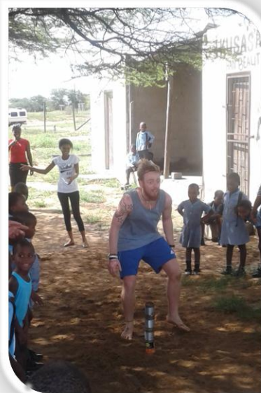
Team from Go-Ahead team meet with Bakusasa staff, children and the board members